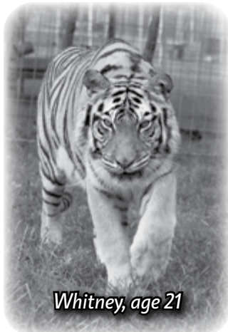
Whitney, age 21