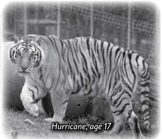
Hurricane, age 17