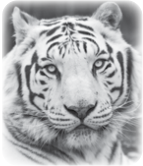
Remington, age 8

In 2022 we also sadly bid farewell to some of our beloved animal residents. Thank you for giving them many years of happy and full lives! Thank you for giving us the privilege of caring for them. Among the several elderly animals whose passing we realized was inevitable, two younger cats stand out.