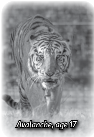
Avalanche, age 17