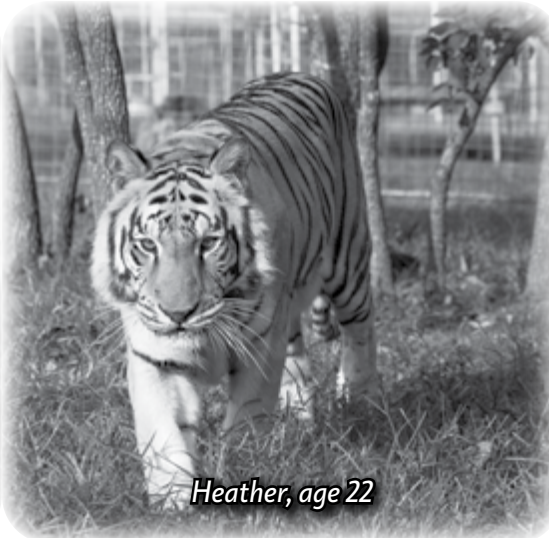
Heather, age 22